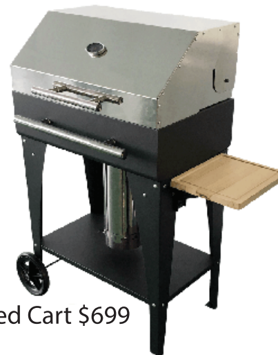
Hooded Cart $699