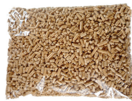
Tasmanian Pellet Fuel for cooking

Around 80% cheaper than an LPG gas BBQ when used for roasting